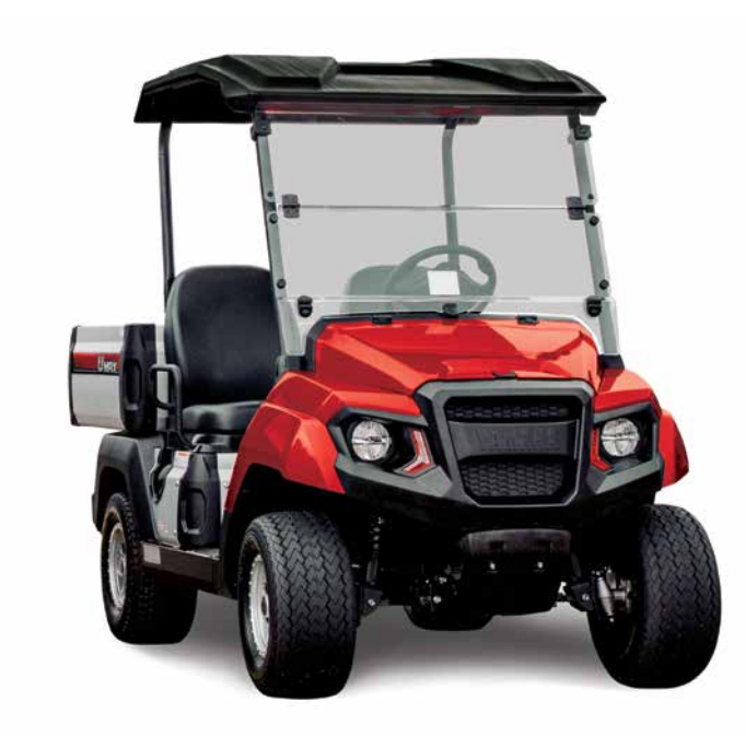
CORAL RED Metallic