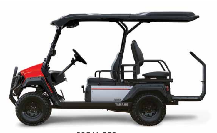
CORAL RED Metallic