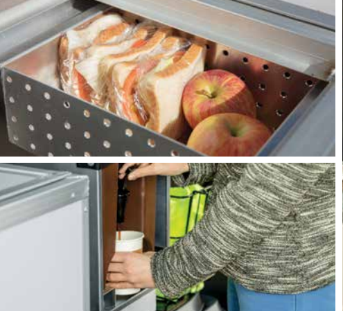
OPTIONAL COFFEE CAMBRO

Keep fresh ice on hand for when your guests need to cool down.