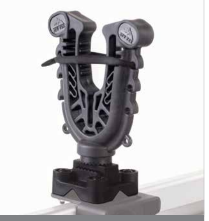
ATV TEK V-GRIP™

NOTE: Requires use of the separately sold ATV TEK V-GRIP™ or ATV TEK FLEXGRIP or ATV TEK Elite Series Cam Lock Grip. (Both are available in singles and doubles). Visit ShopYamaha.com to see all options and pricing.