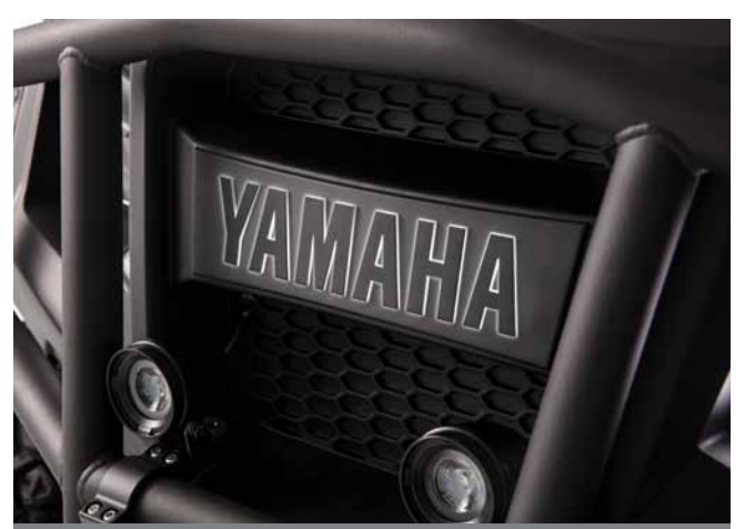
UMAX Yamaha Backlit Logo

NOTE: Accessory Mount Clamps (2HC-F34A0-V0-00) required for installation on Support Sunroof Top or Front Brush Guards, all sold separately.